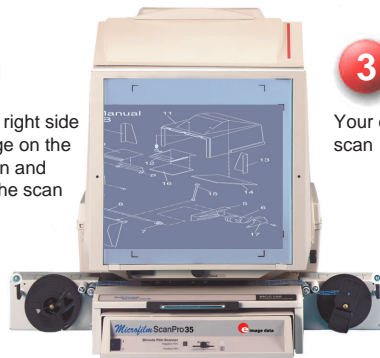
ScanPro35 with 16/35mm roll film carrier